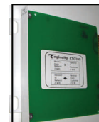
CARD CUT THROUGH 200/400 TYPE