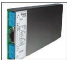
TEST CARD EXTENDER T1 239 TYPE REPEATER BANTAM AND RJ48 JACK

The Service Interface Panel SIP is a Modular solution for organizing and consolidating Service handoff – copper or fiber – that changes as quickly as your needs do.