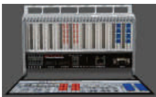
Central Office and Remote Site Alarming- IS9008/IS9000 and IS7000

Unlimited Bandwidth is the Trusted Expert in Network Monitoring and Remote Alarming Solutions